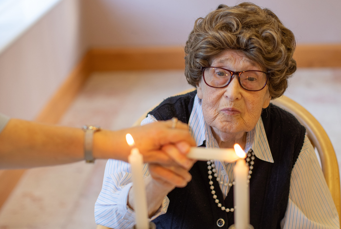
Site visit at Hyde Park Road, Gateshead