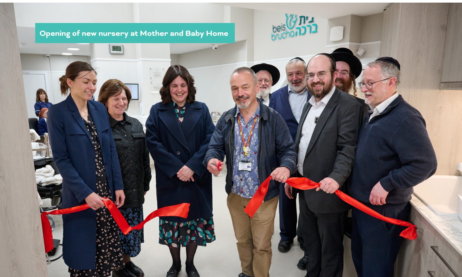
Opening of new nursery at Mother and Baby Home

The Board is responsible for keeping adequate accounting records that are sufficient to show and explain the Association's transactions, and disclose with reasonable accuracy at any time the financial position of the Association, and enable them to ensure that the financial statements comply with the Co-operative and Community Benefit Societies Act 2014 and the Housing and Regeneration Act 2008. They are also responsible for safeguarding the assets of the Association and hence for taking reasonable steps for the prevention and detection of fraud and other irregularities.