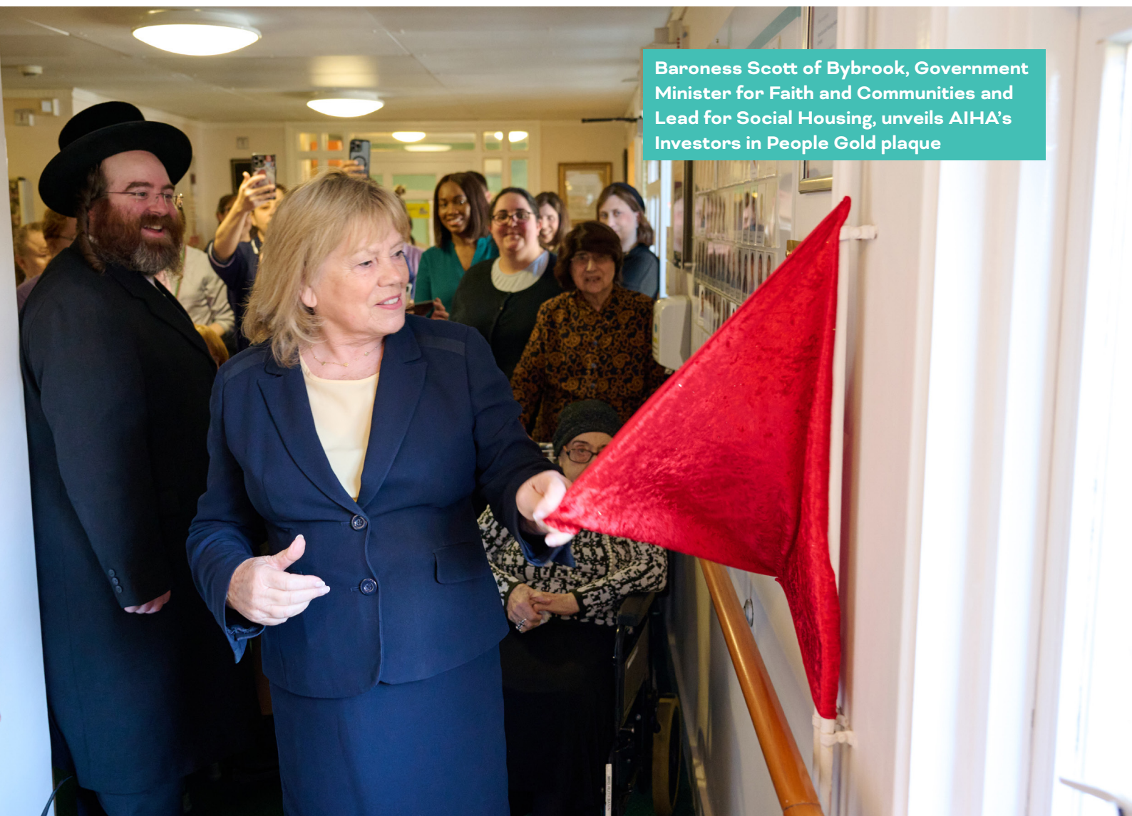
Baroness Scott of Bybrook, Government Minister for Faith and Communities and Lead for Social Housing, unveils AIHA's Investors in People Gold plaque

The target for 2023/24 is to continue the positive trajectory and to move into medium or top quartile comparative performance for the RSH metrics.